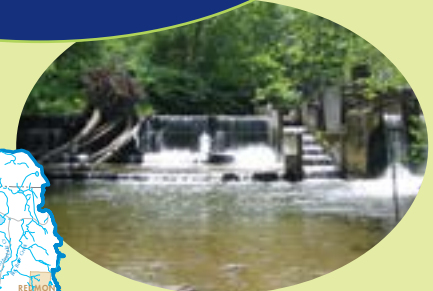
Hatchery Dam before removal

A 12-foot high diversion dam, built to supply water to the Issaquah Hatchery, was removed from Issaquah Creek and replaced with a series of 13 rock weirs to stabilize the channel and provide fish passage. A new fish-passable water intake for the hatchery was also constructed.