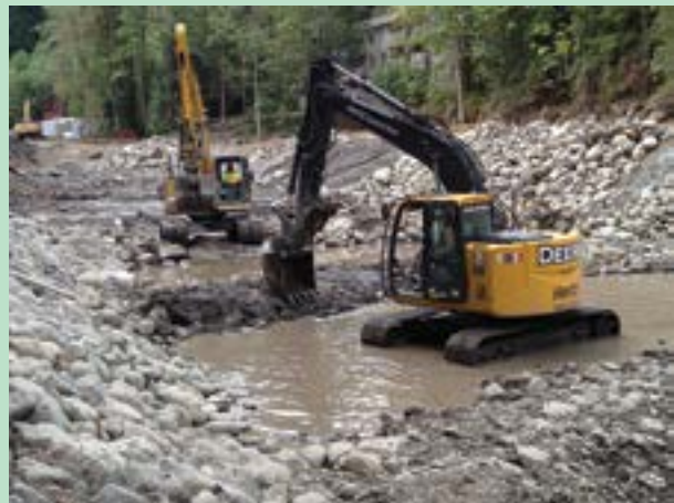
Heavy equipment is used to build new rock weirs.