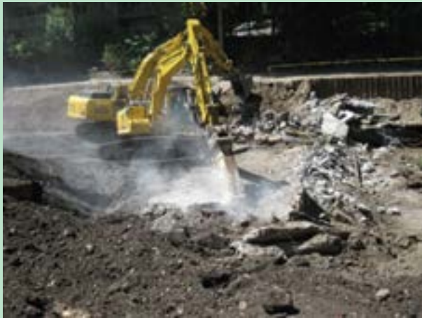
The old dam is deconstructed.

FOR MORE INFORMATION: Kerry Ritland, City of Issaquah, kerryr@issaquahwa.gov , Tim Ward, WDFW, Timothy.Ward@dfw.wa.gov or visit www.issaquahwa.gov/index.aspx?nid=1158