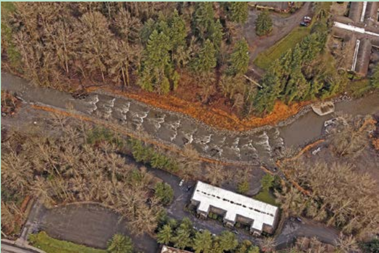
This aerial view of the completed project with water in the channel shows the weirs in action.