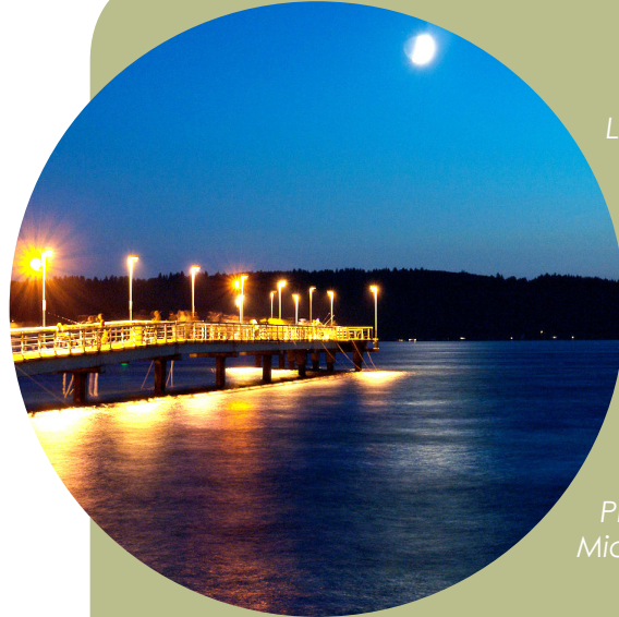
Lighting at night on docks and shore-edge structures may attract juvenile salmon and make them more visible to their predators.