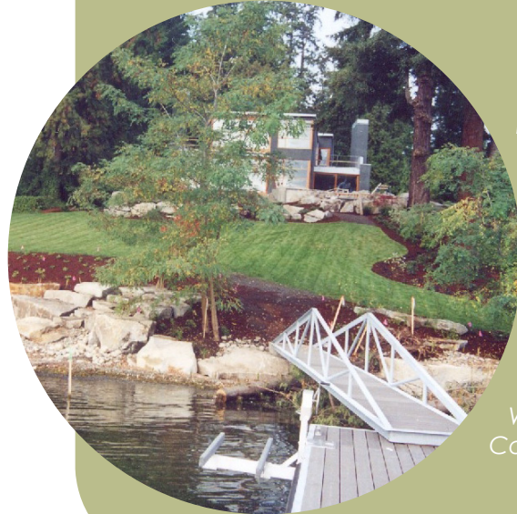
Narrower ramps and walkways reduce overwater shading at the shoreline. Design and photo: The Watershed Company