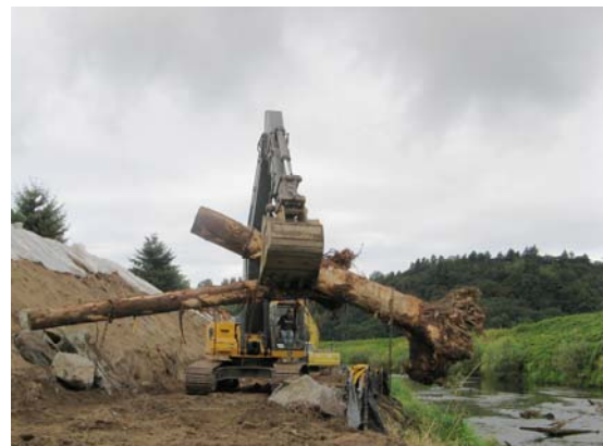
Wood being placed at the Briscoe levee in Kent.

During the summer of 2007, the Green River Flood Control Zone District reconstructed the Briscoe levee in Kent to repair damage from 2006 flooding. As with most modern levee projects, wood is used to protect the levee toe from erosion while improving habitat for fish. The 2007 approval of a county-wide flood levy ensures the construction of more salmon-friendly flood improvement projects in the Lower Green.