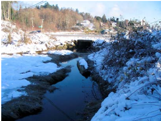
Ellis Creek estuary looking toward the Dockton Road culvert.

Restoration of the Ellis Creek Salt Marsh on Vashon Island will be completed this spring with the planting of native salt marsh plants. Construction in August 2007 reconnected a lobe of the salt marsh at the mouth of Ellis Creek by removing a dirt road that prevented tidal influence to the entire marsh. Juvenile Chinook salmon are expected to use the expanded area for rearing. King County is constructing this SRFB-funded project, which is Salmon Habitat Plan Project NS-10.