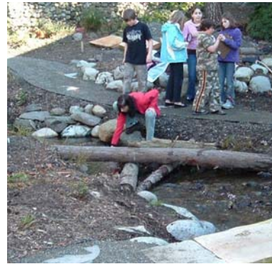
A team of 5th graders from Gatewood Elementary samples for macro-invertebrates in the rebuilt channel near the mouth of Fautleroy Creek.

The lower reach and mouth of Fautleroy Creek, situated on private property adjacent to Puget Sound, was restored in the latter half of 2007. The creek channel was widened and the banks planted with native vegetation. The new stream channel prevented flooding in the December 3 storm. This project was brought about in part through the long-time work of the Fautleroy Watershed Council with funding support from the Department of Ecology, City of Seattle, King County, and King Conservation District.